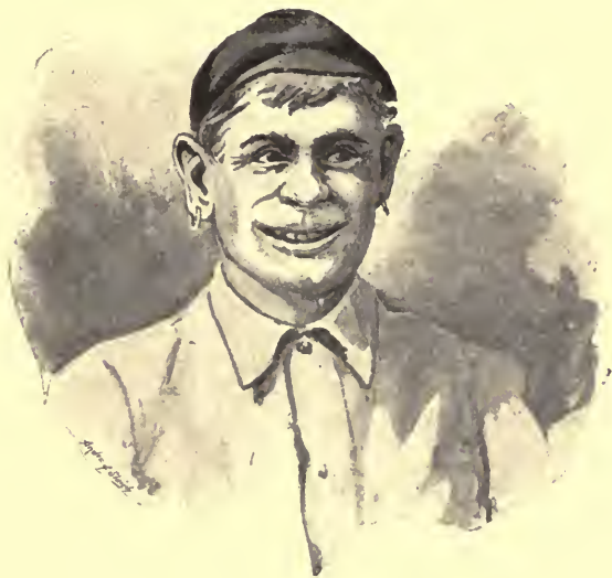
The fat ostler boy.

from the stable opposite. That he spoke English about as well as a French porter at Calais was subsequently a drawback, when it came to words like surcingle and hold-all , and the beautiful